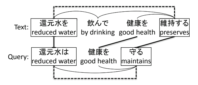
Figure 3: An example of structural alignment

Predicate databases To determine if two predicates are semantically related, we consult a database of predicate relations [14] and a database of predicate entailments [6] using the predicates' default case frames. E.g. <維持する iji-suru "to preserve" - 守る mamoru "to maintain"> and <予防する yobou-suru "to prevent" - 気をつける ki-wo-tsukeru "to be careful">